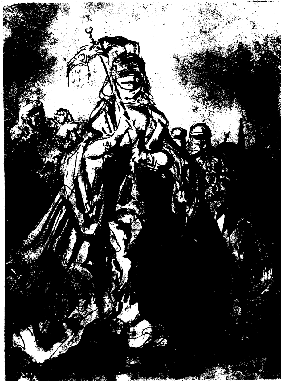
9. Guys: A Turkish Woman with Parasol . Pen and water-colour. Paris, Petit Palais.