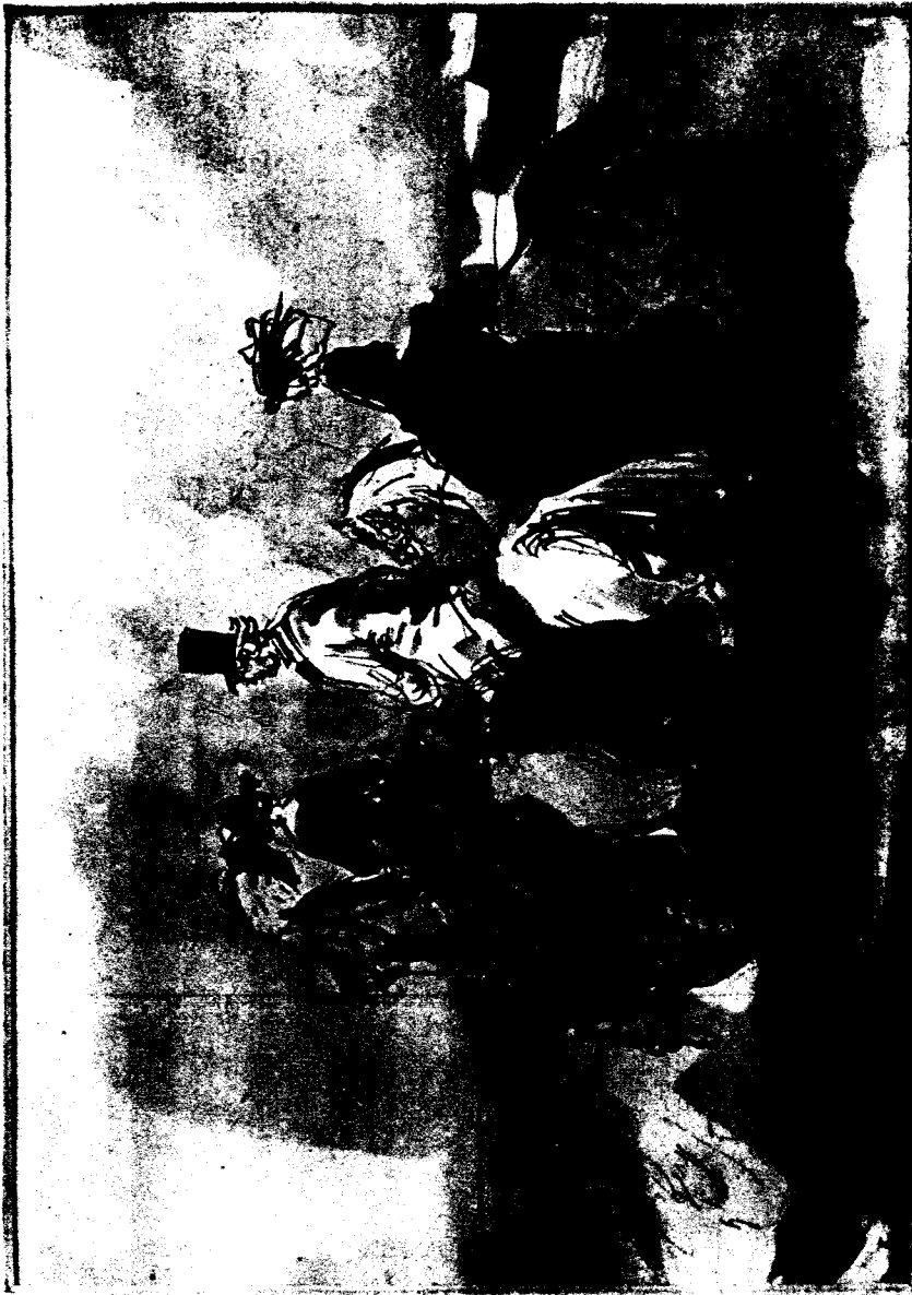
24. GUYS: The Morning Ride . Pen and ink and wash. Private Collection.